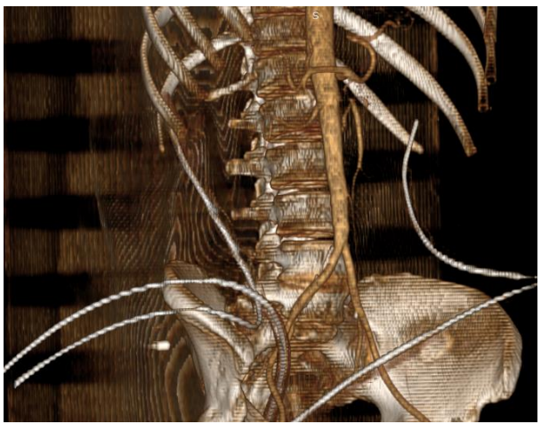
Figure 1 – 3D reconstruction showing the occlusion of superior mesenteric artery

The second surgery was performed after four days, discovering still viable, but dilated parts of the small intestine, with a thick wall and without peristalsis, from the duodenojejunal flexure, for a length of 1.5 meters. The rest of the bowel, up to 3 centimeters before the ileocecal valve, was necrotic, perforated and with stercoral perforation. Small intestine resection of the necrotic portion was performed with a jejunostomy on the right side of the abdomen. The postoperative evolution was favorable, but the leukocytosis was still increasing and a significant stasis was also observed on the nasogastric tube. The CT scan performed six days after the surgery showed a proximal stenosis on the superior mesenteric artery of 75%, with conglomerated intestines in the left iliac fossa, with the presence of a mixed liquid accumulation (Figure 1 and 2). In addition, liquid accumulations were observed close to the sigmoid colon and root of the mesentery, which required a third surgical intervention. During the laparotomy, cecal ischemia was observed, as a consequence of the extension of the mesenteric infarction, and required a right hemicolectomy. The postoperative evolution was favorable and the patient was discharged after another nine days of recovery, along with Clexane and Tonotil-N as treatment.