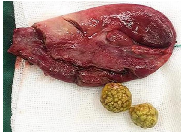
Figure 3 - The gallbladder and its gallstones after resection

A cholecystogastric fistula was also seen between the gallbladder and the stomach wall, from which gastric secretions exuded. Due to two large gallstones in the gallbladder, the patient underwent cholecystectomy. The gallbladder after resection can be seen in Figure 3.