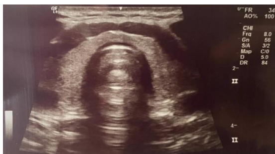
Figure 3 - Thyroid ultrasound: Right thyroid lobe: 2/1.78/4.22cm, isthmus: 0.4cm, Left thyroid lobe:2/1.8/3.86cm, Echostructure: isoechoic, fine granular, low Doppler signal, laterocervical region: inflammatory polyadenopathies.