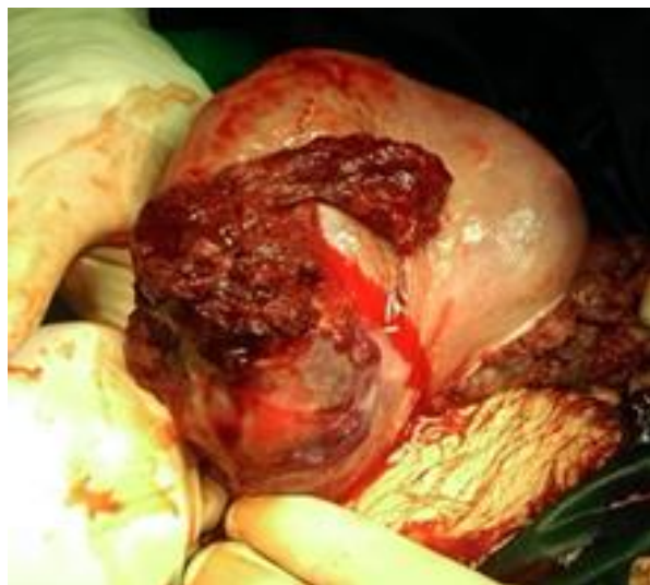
Figure 1 - Intraoperative image of uterine rupture

uterine wall. The uterine scar from the previous caesarian section was intact. Because of the massive uterine bleeding and incoagulable PT-INR, an emergency hysterectomy was performed. Figures 1-3 show intraoperative uterine rupture and suture. Figure 4 shows excised uterus. The patient was discharged from the hospital after 5 days with good general status and no post-surgical complications.