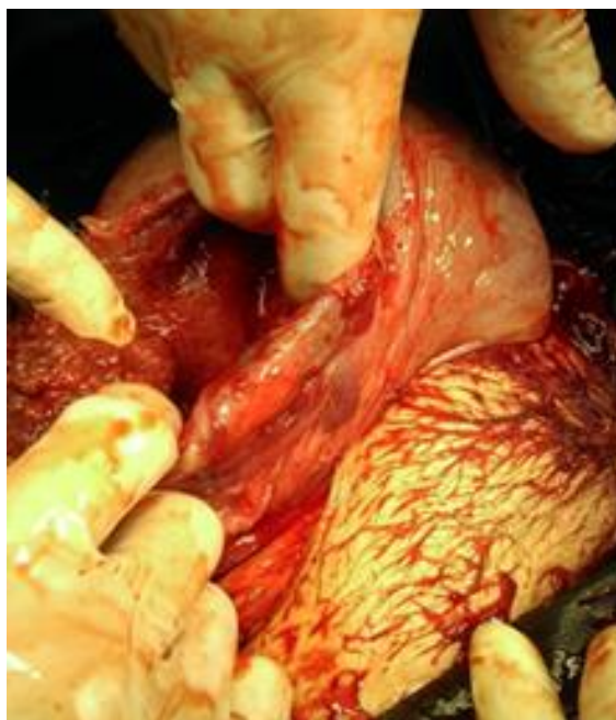
Figure 2 - Intraoperative image of uterine rupture

incidence is 4-9%. Maternal mortality is considered to be between 1-13% with a high perinatal 74-92% mortality.