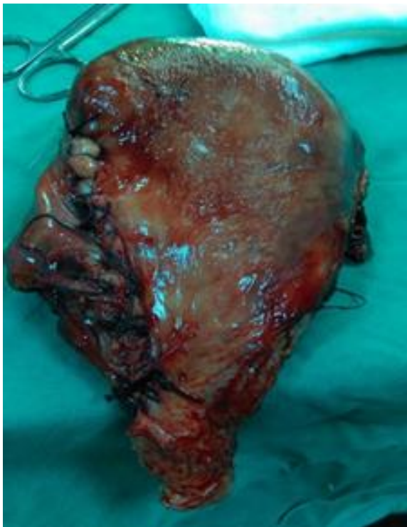
Figure 4 - Excised uterus

The severity of symptoms during uterine rupture in pregnancy is closely related to the timing and the extent of uterine defect. Uterine rupture on an unscarred uterus is more violent and can have a greater hemodynamic impact than a rupture occurring on a previous uterine scar. This can be explained because of the reduced vascularity in the scarred tissue. Because of the catastrophic effect of the uterine rupture, a fast diagnosis must be done. The most common signs and symptoms are fetal heart rate anomalies, maternal and fetal bradycardia, blood pressure drop, uterine hyperstimulation, loss of uterine tonus or ceasing of contractions, abnormal labor, abdominal pain, vaginal bleeding and shock. When these signs and symptoms are present, the doctor should perform transabdominal ultrasonography. Rozenberg et al studied the thickness of the lower uterine segment in pregnant women at 36-38 weeks of gestational age. The results showed that the risk of uterine rupture is significantly greater if the uterine wall is thinner than 3.5 mm. Using this value as a cutoff, the authors had an 88% sensitivity and a 73% specificity in predicting subsequent uterine rupture [11].